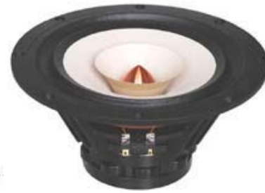
8" PAPER FULL RANGE